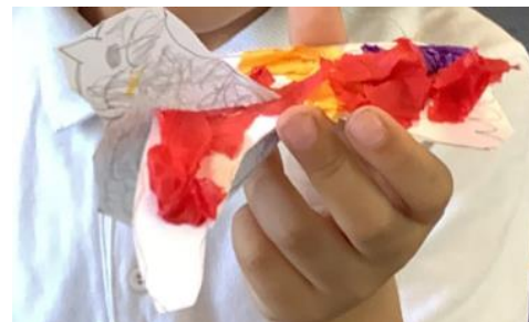
Year 1 Art