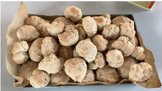
Delicious homemade bread!

In Literacy the children have been writing instructions how to bake bread. The children have then followed their instructions to make delicious bread.